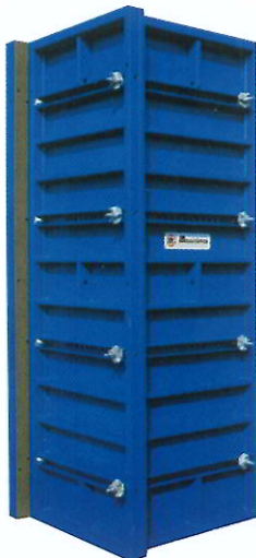
Column by drilling

It is fully compatible with the Wood-Metal line forms and with all its complements and accessories.