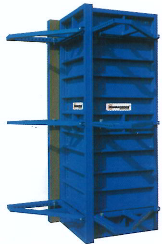
Column by squares

It is possible to manufacture the frame of this line prepared with several holes in order to allow using it with a special fitting for closing the plates and getting columns (identical sizes that the Wood-Metal line ones).